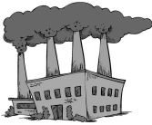
Electric Power Plant