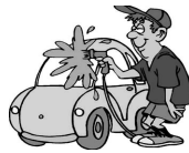
Washing the Car